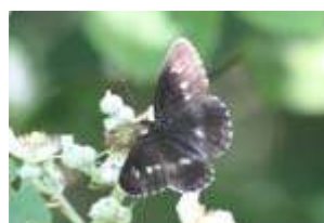
White Admiral ab.obliterae