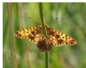
Small Pearl-bordered Fritillary