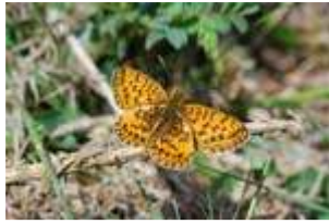
Small Pearl-bordered Fritillary

Peter Hunt reports from Ningwood Common, Isle of Wight (SZ394900) where the following observations were made: Brimstone (2), Common Blue (5), Grizzled Skipper (2), Small Heath (8), Small Pearl-bordered Fritillary (3), Speckled Wood (2). "The weather was much improved today at this sight and the small pearl-bordered fritillaries were very active. A nightingale was very vocal".