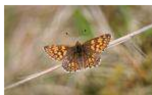
Duke of Burgundy