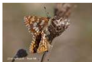
Duke of Burgundy

Bob Snelgrove reports from Noar Hill Selbourne (SU745316) (89): 8 x Duke of Burgandy 1 x Holly Blue 1 x Brimstone 1 x Peacock 2 x Speckled Wood 1 x Small Tortoiseshell 6 x Orange-tip 1 x Common Blue 3 x Small White. "On a sunny day with a slight coolness in the air I was lucky to observe a pair of D of B mating. After spending several hours on the site my total count of Dukes was 8 at two different locations. A fellow observer took photos of mating and has promised to submit them to this website."