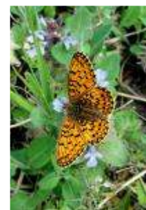
Small Pearl-bordered Fritillary

Roger Pendell reports from Noar Hill (SU737321) where the following observations were made: Duke of Burgundy (11), Common Blue (57), Small Heath (14), Dingy Skipper (4), Orange-tip (1 "female"), Large White (1), Brown Argus (2), Small White (2).