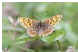
Duke of Burgundy

Richard Symonds reports from Noar Hill (SU745318) where the following observations were made: Green-veined White (3), Speckled Wood (1), Peacock (1), Duke of Burgundy (2 "1 Male and 1 Female"), Common Blue (1 "Male"), Cinnabar (1), Burnet Companion (3). "Sightings were made over a period of 100 minutes. The weather was cloudy with short sunny intervals with a cold wind. Temperature was a mere 9°C."