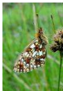
Small Pearl-bordered Fritillary