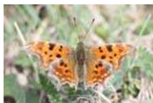
Comma f hutchinsoni