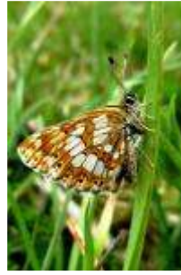
Duke of Burgundy