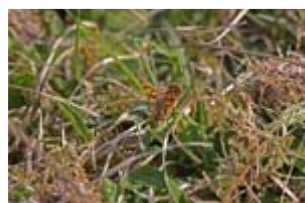
Duke of Burgundy

Mike Duffy writes: An early morning walk around Noar Hill had me see 2 Duke of Burgandy, 1 male and 1 female, also 1 Orange-Tip and 1 Peacock and 2 Pyrusata speci moths.