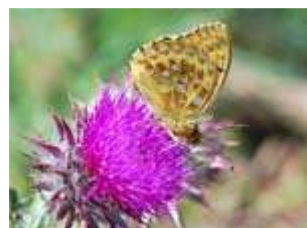
Dark Green Fritillary