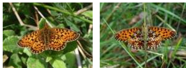
Small Pearl-bordered Fritillary

Alan Thornbury reports from the New Forest: A total of 11 Small Pearl-bordered Fritillaries were seen this afternoon in a New Forest inclosure. They were feeding on thistles and ragged robin in two damp clearings, resting on foliage or grass stems during cloudy spells.