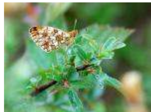
Small Pearl-bordered Fritillary

Peter Hunt reports from Ningwood Common, Isle of Wight (SZ394900) where the following observations were made: Small Pearl-bordered Fritillary (1), Common Blue (2), Grizzled Skipper (1). "On a wet rainy day sightings were few at this excellent sight".