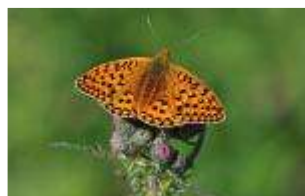
Dark Green Fritillary

Mark Pike reports from Martin Down (wooded area opposite side of car-park) (SU032204 (approx)) where the following observations were made: Brimstone (4), Brown Argus (1), Common Blue (10), Dark Green Fritillary (5), Green Hairstreak (1), Green-veined White (1), Grizzled Skipper (1), Large Skipper (30), Marbled White (1), Meadow Brown (10), Red Admiral (1), Ringlet (1), Silver-washed Fritillary (4), Small Blue (1), Small Heath (40), Small Tortoiseshell (3), Speckled Wood (7), White Admiral (1). "Visited between 09.00am and 12.15pm."