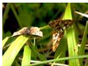
Small Pearl-bordered Fritillary

Peter Gardner reports from Bentley Wood: "very good day lots of sun and butterflies small pearls 18 pearls 1 large skippers 3 brimstones 2 speckled wood 20 dingy skip1"