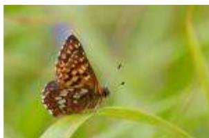
Duke of Burgundy

Peter Eeles reports from Near Stockbridge Down where the following observations were made: Duke of Burgundy (24), Brown Argus (12), Common Blue (5 "All male"), Dingy Skipper (1 "An albino aberration"), Brimstone (3).