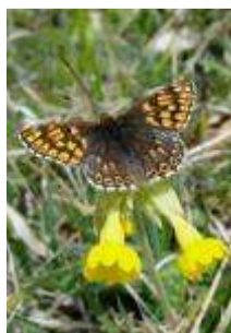
Duke of Burgundy

Dave Miller reports from Noar Hill (SU743319) where the following observations were made: Peacock (4), Small White (4), Speckled Wood (4 "Mating pair observed"), Brimstone (3 "2 m, 1 f"), Holly Blue (1), Orange-tip (5 "All males"), Dingy Skipper (2), Duke of Burgundy (3 "All males. Freshly emerged"). "Warm hazy sunshine (17-19 degrees). Light SE breeze.".