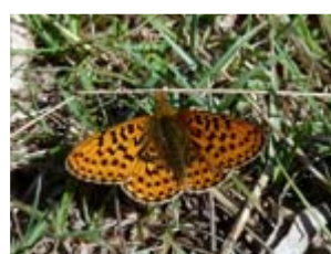
Pearl-bordered Fritillary Pearl-bordered Fritillary

David Tining & Mick Langridge reports from Old Railwayline, Alverstoke, Gosport (SZ607989) where the following observations were made: Red Admiral (2 "males basking & flying high in aerial combat").