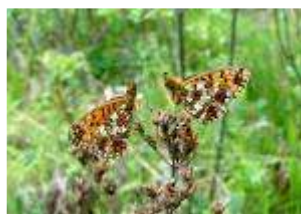
Small Pearl-bordered Fritillary

Dave Miller reports from Bentley Wood (E. Clearing) (SU260292) where the following observations were made: Pearl-bordered Fritillary (6 "One male; three female. Other two uncertain"), Small Pearl-bordered Fritillary (20 "Mostly male"), Brimstone (1 "One female"), Speckled Wood (1), Speckled Yellow moth (5). "Many newly emerged Small Pearl-bordered Fritillaries. Late afternoon: warm with reasonable weakish sun and a little breeze. The SPBF were starting to congregate on dead seed heads in groups - five together within a metre of each other in one instance. Some Pearl-bordered too, looking worn and pale but stronger and higher flying than their cousins. All definitely at the Hampshire end of the clearing!"