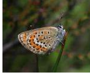
Silver-studded Blue Silver-studded Blue Silver-studded Blue

Mr David W Hunt (BC123210) reports from Our garden in Stubbington (SU550033) where the following observations were made: Large White (1), Peacock (1).