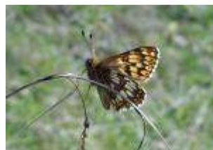
Duke of Burgundy