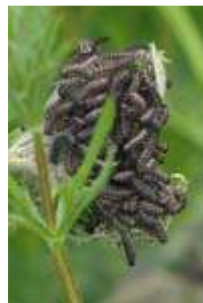
Small Tortoiseshell larvae