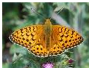
Dark Green Fritillary