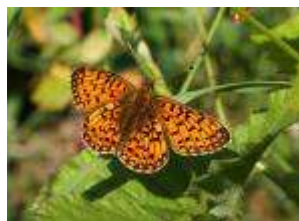
Dark Green Fritillary Small Pearl-bordered Fritillary

gary palmer reports from shirley holms (sz 296 986) where the following observations were made: Small Heath (1), Silver-studded Blue (54 "only 2 female, all looked fresh"). "after walking around wootton coppice this morning i made a visit to the heath at shirley holms and found a good number of fresh silver studded blue, the hatch being somewhat later than the last few seasons."