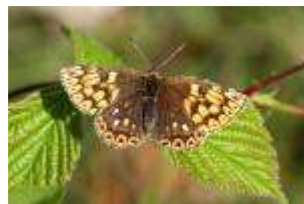
Duke of Burgundy

Lisa & Gary Richardson reports from Broughton Downs (SU287329) where the following observations were made: Large White (2), Brimstone (2), Orange-tip (1), Speckled Wood (1), Small Heath (5), Green Hairstreak (1), Small Copper (2), Brown Argus (8), Grizzled Skipper (8), Dingy Skipper (11), Common Blue (45), Adonis Blue (4), Duke of Burgundy (1).