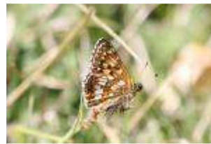
Duke of Burgundy