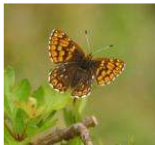
Duke of Burgundy

Paul Crook reports from Noar Hill (SU738322) where the following observations were made: Common Blue (6), Dingy Skipper (10), Green-veined White (2), Large White (1), Orange-tip (2), Small Heath (3), Duke of Burgundy (20).