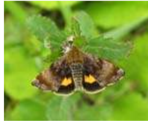
Small Yellow Underwing

Sue Clark writes: "Pleased to see the day flying Small Yellow Underwing in our mini meadow front lawn this morning, the first recorded here. Common Mouse-ear, one of its larval foodplants, grows in the lawn."