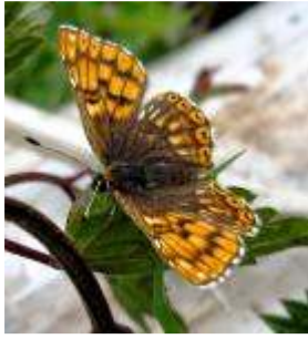
Duke of Burgundy