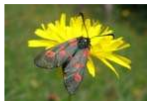
Narrow-bordered Five Spot Burnet

GBE reports from back garden (SU80335524) where the following observations were made: Small Tortoiseshell (1).