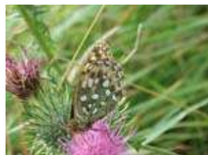
Dark Green Fritillary