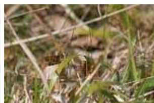
Duke of Burgundy