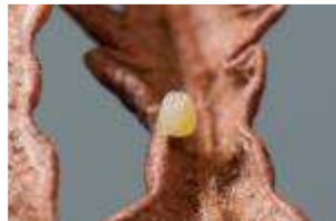
Pearl-bordered Fritillary egg