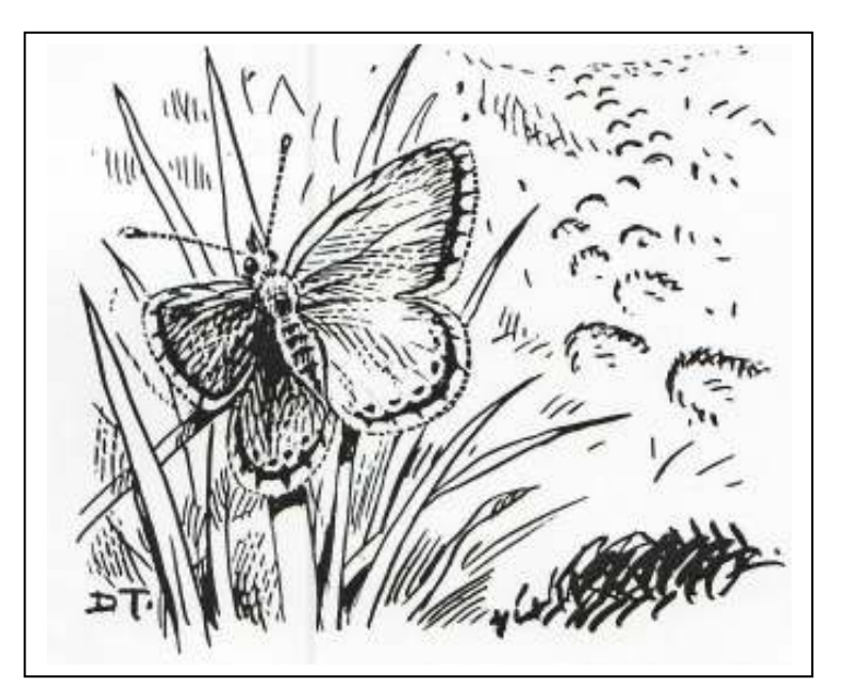
Illustration by Dave Thelwell