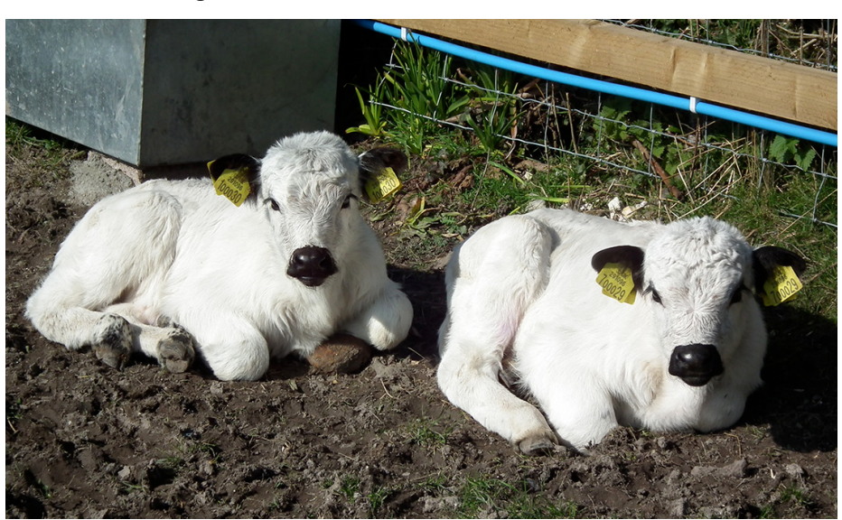
British White Cattle

We don't yet know what impact the wet weather will have had on butterflies that have specific requirements. Species such as the Brown Argus do not like the wet, and overwinter in the ground in the larval stage. The adults emerge in early May, peaking at the end of May and beginning of June, and produce a second brood that emerges at the end of July. Numbers of this butterfly at Magdalen Hill Down in 2012 were well above the national average, and this year's monitoring will help us evaluate any long-term weather-related impacts. Keep an eye out for them and if you are unsure of how to differentiate the female Brown Argus from the female Common Blue have a look at the following website: www.ukbutterflies.co.uk