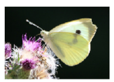
Large White at Holmsley

Gatekeeper have increased in numbers and Meadow Brown almost halved. Speckled Wood are making a strong comeback and Grayling counts are twice that of Week 15. Silver-studded Blue and White Admiral are clearly on the wane. No Small tortoiseshell reported this week and Red Admiral are also low in numbers but hopefully expected to increase soon with the arrival of some continental cousins.