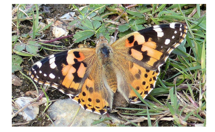
Painted Lady at Mockbeggar John Levell

Week 26 yielded only 475 butterflies (excluding the exploratory Roe Transects) at a density of 5.96 butterflies/km - still a very respectable rate for Week 26 (the best was 6.3/km in 2017). Three Clouded Yellow were seen this week at Warren Farm. Frohawk & Ibsley