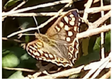
Speckled Wood, Normandy Marsh

start to look out for Speckled Yellow (<a href="http://www.ukmoths.org.uk/species/pseudopanthera-macularia/">http://www.ukmoths.org.uk/species/pseudopanthera-macularia/</a>) - a distinctive day flying moth that has been recorded on a number of our transects in past years. It is most often seen in woodland rides and is easy to spot - it looks like a butterfly! Remember that Orange Underwing (looks like a fluttery orange butterfly in flight) and Emperor Moths, featured in previous newsletters, could also still be around.