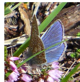
Common Blue - Peter Bates

What a difficult week this was to get a valid result with even a few 'zero' counts now creeping in. A total of 936 butterflies were seen, the lowest weekly count this year since Week 11 (1,690). The density of 7.74 butterflies/km of transect length was the lowest for Week 21 since 2014 (5.88). Gatekeeper numbers have dived to under 100 following a peak of 3,092 in Week 17. Only one Silver-studded Blue was recorded but Small Heath numbers have increased. Although Grayling numbers have also declined the current total for 2020 (704) has passed the 2019 figure of 584 and we hopefully have a couple of weeks of their flight period to come.