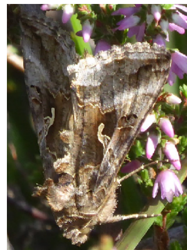
Silver Y - Anne Hobbs

For the second week running, Silver Y moths were seen in good numbers on many transects. Hopefully they will still be around this week as well, so please keep eyes open for this quick flying grey moth with the distinctive 'Y' marking visible when they settle. Two other species that might be spotted at this time of year are the Treble-bar and Lesser Treble-bar . If seen, please try to get a photo to help clarify which you've seen!