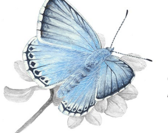
Chalkhill Blue Rosemary Powell

Members unable to attend but who wish to submit prints may do so by post to: Clive Wood, 68 St Cross Road, Winchester, SO23 9PS. Please ensure you enclose a stamped addressed envelope if you wish your prints to be returned.