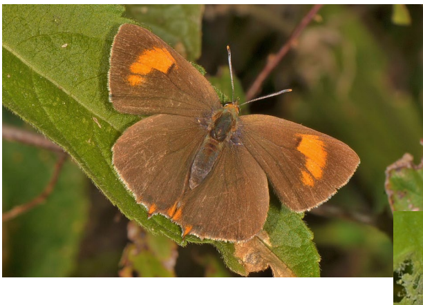
Brown Hairstreak - female