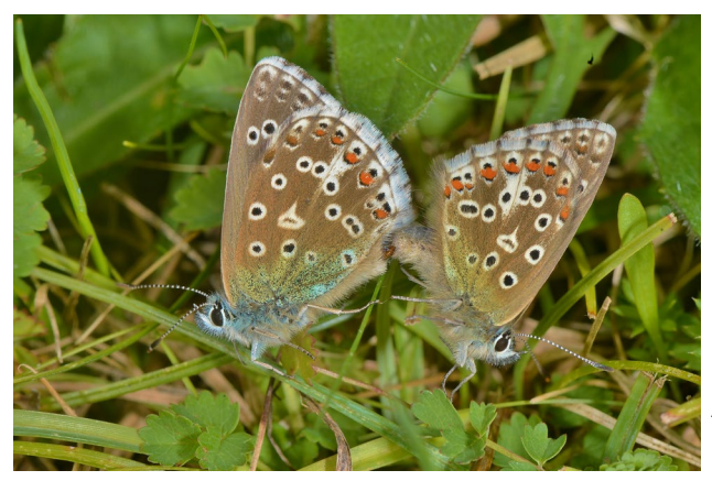
Mating Adonis Blues

Last year we were delighted when the Adonis Blue butterfly took a liking to Magdalen, so much so, it decided to breed on the reserve and produced a second generation. This year, sadly, its presence was not that evident, although a few individuals were seen.