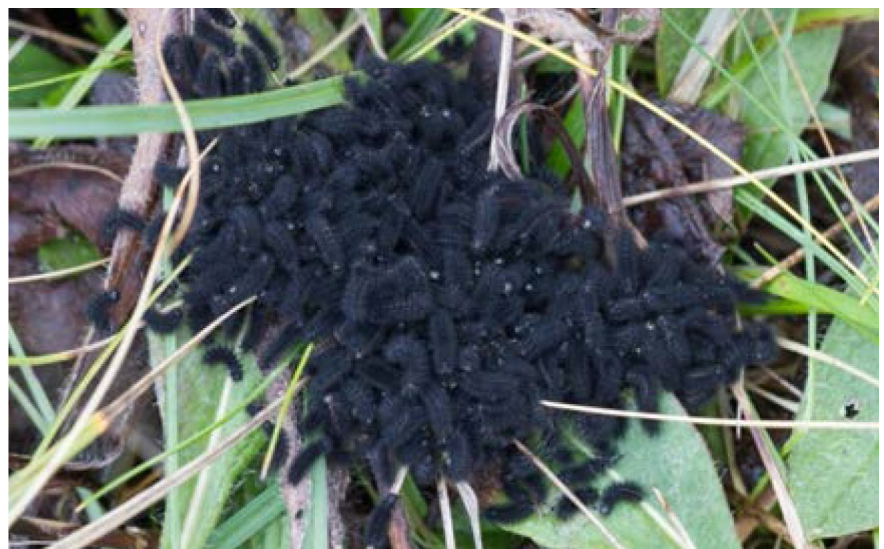
Marsh Fritillary caterpillars

Our main conservation focus over recent years has been our reserves, but also with landscape conservation initiatives such as the Tytherley woodlands (for Pearl-bordered Fritillary) and the "Dukes on the Edge" project for Duke of Burgundy. In 2012, work started to assess whether a network of sites in north-east Hampshire (another key landscape) provided enough suitable habitat to consider the possibility of reintroducing the Marsh Fritillary. Conservation grazing had been re-introduced onto many of the former breeding sites between Fleet and Farnborough and the survey work showed that a substantial network of suitable habitat remained in place. Indeed, the area is probably the only viable landscape for the species in south-east England. The land is owned by the Ministry of Defence and managed by the Hampshire and Isle of Wight Wildlife Trust (HIWWT). Over half the area has Site of Special Scientific Interest (SSSI) status explicitly for the Marsh Fritillary.