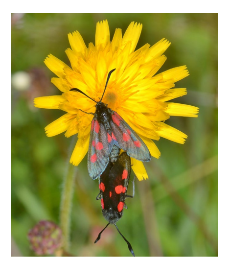
Six-spot Burnet moths