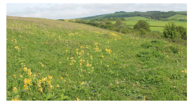
Cowslips on Magdalen Hill Down.

Current vacancies include the position of Webmaster and Wider Countryside Butterfly Survey co-ordinator. If you have some free time and want to be considered for either of these two roles do please make yourself known.