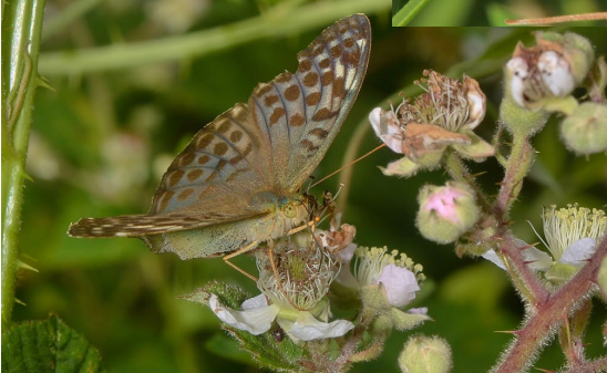
Valezina Silver-Washed Fritillary

Havant Thicket Purple Class of 2015