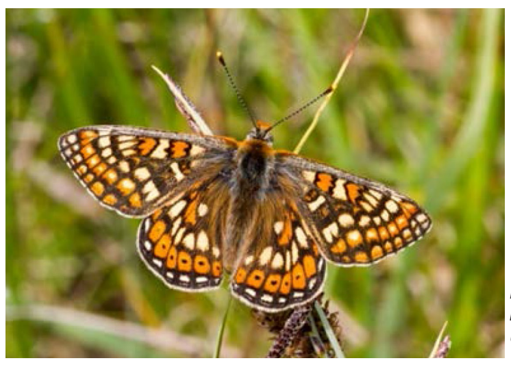
Marsh Fritillary Pete Eeles, UK Butterflies

Most members will be aware that we launched an appeal over the summer to help re-introduce the Marsh Fritillary ( Euphydryas aurinia ) to its former stronghold sites in the north-east of the county. Although the Marsh Fritillary can be found across continental Europe from Ireland in the west to the Ural Mountains and beyond, it lives in localised colonies that are threatened across much of its range by changes in farming practice and loss of habitat. It favours damp grasslands that are particularly vulnerable to intensive land use, drainage, afforestation and urban development.