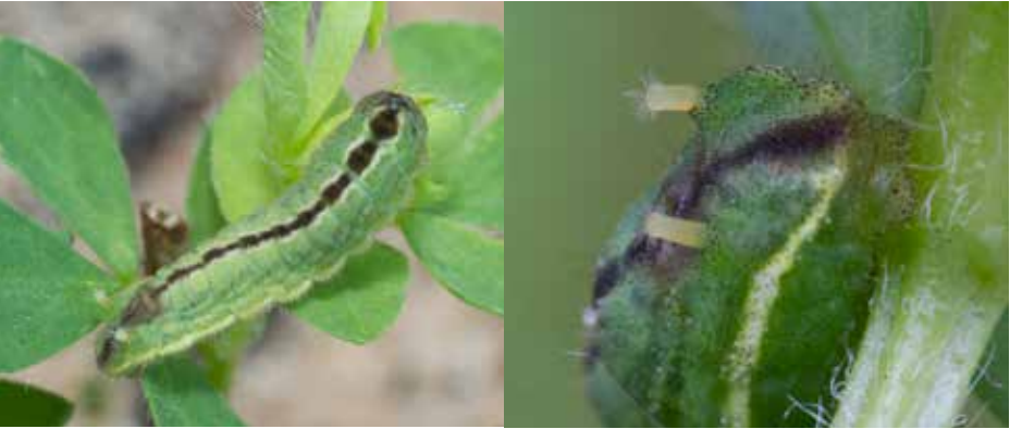
Final instar Silver-studded Blue larva