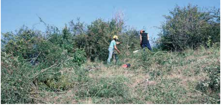
Clearing the scrub to reveal the chalk downland flora.