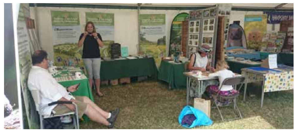
The Butterfly Conservation stand at the New Forest Show

The Branch is developing an excellent relationship with the organisers of the New Forest Show and for the second year running we were delighted to have a display stand for all three days of what is one of the largest county shows in southern England. The event provides us with a wonderful opportunity to talk about butterflies and moths with members of the public and how they can help to understand and conserve these beautiful insects. The weather was excellent throughout and the stand was busy with visitors asking questions or looking at our display.