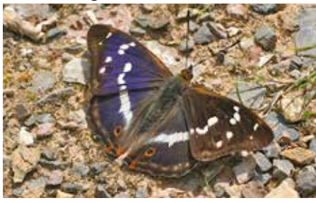
Male Purple Emperor

What followed was a copy of The Observers Book of Butterflies and a deep desire to write a book on the subject one day. Teenage years kindled other interests and so my middle years are best described as bringing up a family, and it was only about seven years ago that my early love of butterflies and moths was rekindled when reading the Sightings pages on the Hants & IOW Butterfly Conservation website. I salivated for a year seeing sightings of butterflies and moths that I had never seen, before deciding I had to join the throng of recorders.