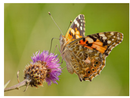
Painted Lady. Freya Brown

It is possible to spot the odd piece of good news . The birthday cards I buy are no longer wrapped in single-use film. Small cafés in small villages on the top of small islands in the Canaries now use recyclable cups and non-plastic stirrers. The consumption of plant-based food seems to be increasing rapidly at the expense of meat in many countries and electric car sales are also increasing, albeit still dwarfed by the sale of large, diesel-powered SUVs. In the UK, the new Environmental Land Management Scheme holds out the prospect of better targeted payments for more environmentally sensitive farming practices.