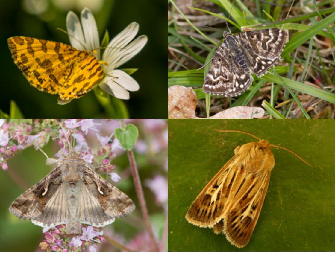
top left clockwise - Speckled Yellow, Mother Shipton, Antler Moth, Silver Y

You might also notice the similarly coloured Cinnabar, which has red stripes down the leading edge of its forewings in place of the Burnets' spots, or the Forester, a plain green moth. This habitat also supports the Burnet Companion, a stripy brown moth, and the greyer Mother Shipton, so named for the pattern of a 'face' on its forewings.