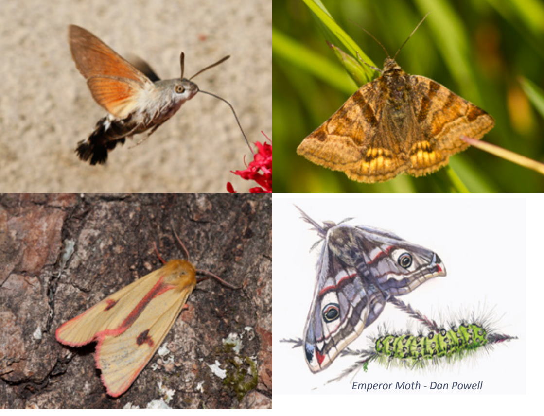
bottom left clockwise - Clouded Buff, Humming-bird Hawk-moth, Burnet Companion

These last two can be told apart by the latter's habit of perching with its wings held over its back, like a butterfly. The sexually dimorphic Clouded Buff is unmistakable and flies as readily in daytime as at night; the same applies to the Antler Moth, with its streaked 'antler-like' mark on the forewing. Both these species favour rough, open habitats such as downland and heaths. In the garden the Small Purple and Gold (Mint Moth) is often found on marjoram or mint and can fly as late as September.