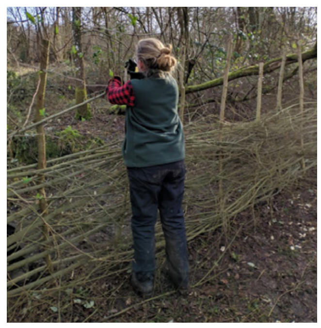
Jane Plenderleith erecting a dead-hedge. Alex Billimore

At the time of writing and in my usual rush to meet the newsletter copy deadline, I decided once again to add up the volunteer hours that have been spent at the work-parties between the months of October 2019 to January 2020, (with practical tasks in February and March still to complete). The time that the volunteers put into the reserves added up to a staggering 530 hours, which equates to approximately 70 days of work. In addition, we had contractors out for four days to tackle some of the preparation work such as felling old and diseased trees and cutting thorny scrub and dogwood.