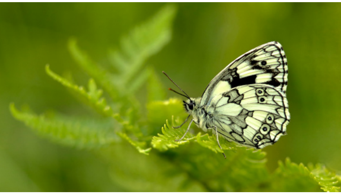
Marbled White.