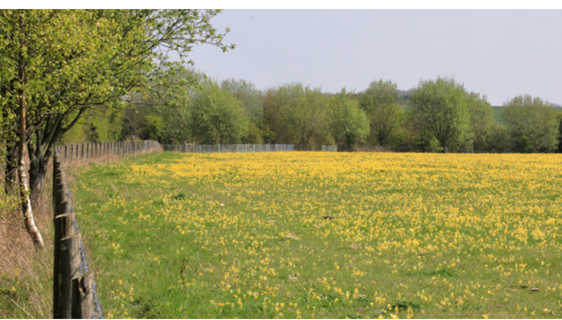
Cowslips at Magdalen Hill Down.

It is quite wonderful walking around the reserves and noticing signs of early spring, with the Cowslips and Bedstraws showing new growth and a Red Admiral butterfly on the wing at Magdalen on 29 January. Each year we collect seed from the hay meadows and use this to enhance other areas such as the scrapes along the bottom of Magdalen Hill Down bordering the A31. Here we scattered seed from Dark Mullein which is the food-plant of the Striped Lychnis moth. The scrapes were created to benefit this particular species in 2016 with great results. We collected quite a large amount of Cowslip and Kidney Vetch seed in 2019 – if anyone is interested in scattering some on a bit of bare ground, or short turf, or if you have a small conservation project on the go, please get in touch with me to arrange for some seed collection from the meadows in 2020.