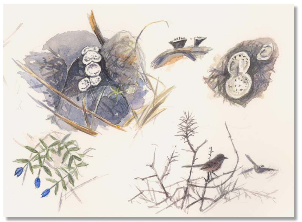
Inspires artists too! Nail Fungus - New Forest. Dan Powell