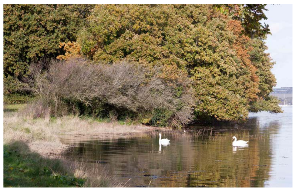
Swans on the foreshore. Francis Plowman

As a kid in 1960s Gosport I could not visualise Monks Walk as a butterfly haven. Indeed, for a time the area was the borough's landfill for household waste! In the early 1970s today's designated butterfly meadow was a huge car breaker's yard with wrecks standing three high all over the oil-soaked site. Today all that has gone and nature once more returned for the benefit of the public.