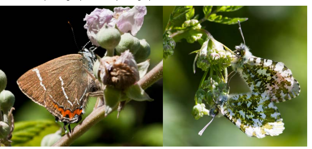
White-letter Hairstreak on bramble blossom. Orange-tip mating pair.

Since 2015 I have been walking this area and sending annual sightings to the Countryside Officer of GBC as well as contributing statistics to Living Record and posting reports and photographs on the Branch website.