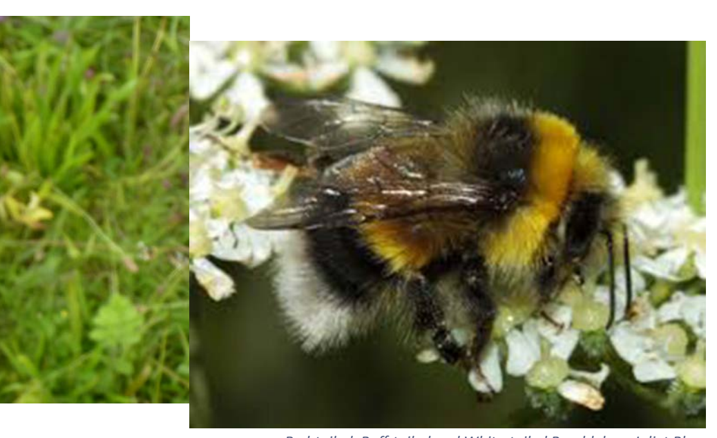
Red-tailed, Buff-tailed and White-tailed Bumblebee. Juliet Bloss

Studies have shown that as a bee approaches a flower, a tiny electric field is created between plant and pollinator which may signal that the plant's nectar supply has been temporarily depleted, thus warning the bee to forage elsewhere and not to waste valuable feeding time. Some plants renew their nectar in a matter of 20 minutes, some take a full day. A real star in this respect is Borage, which is said to take only two minutes to refill. Plants which have a number of blooms on one stem, such as Alliums and flowers in the daisy family are popular with short-tongued bees, allowing them to feed