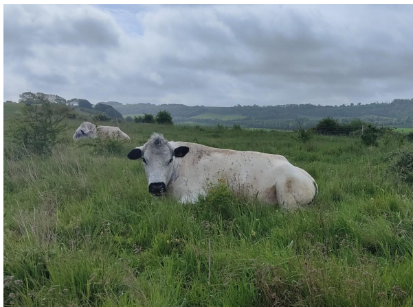
British White cows