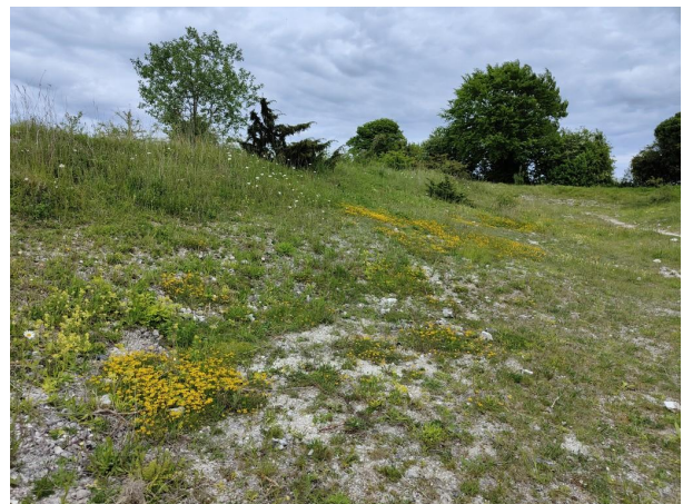
Horseshoe vetch on the chalk scrapes